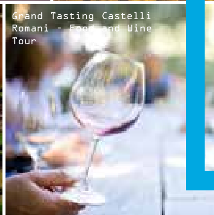
Grand Tasting Castelli Romani - Food and Wine Tour