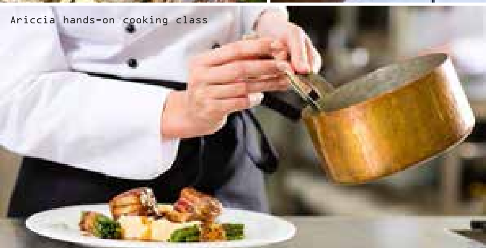
Ariccia hands-on cooking class