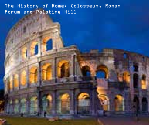
The History of Rome: Colosseum, Roman Forum and Palatine Hill